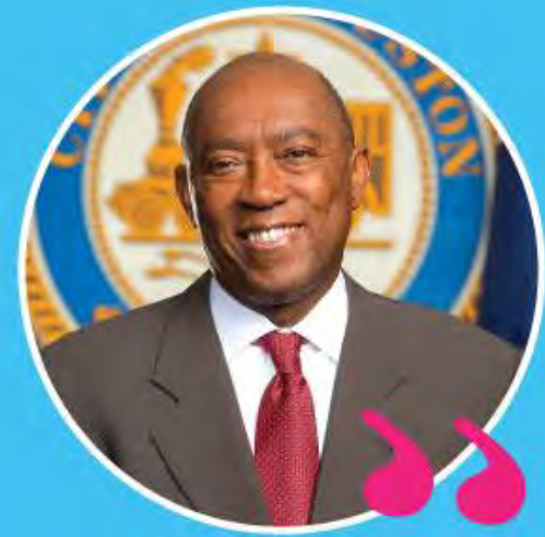
SYLVESTER TURNER Houston Mayor