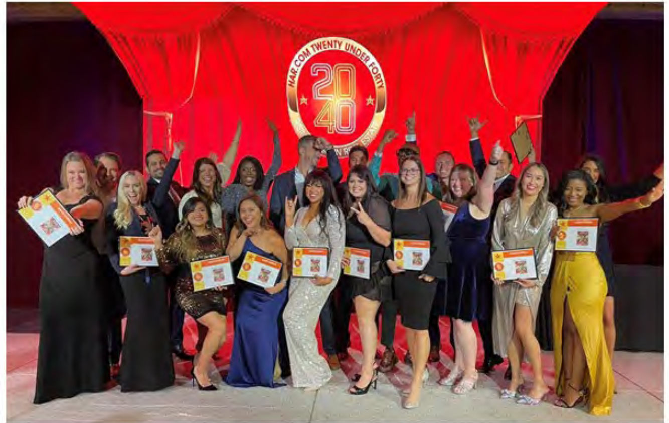
2022 YPN 20 Under 40 Rising Stars in Real Estate