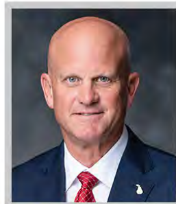
Mayor Kevin Cole*

Elections in the City of Pearland Election Day: May 6 | Early Voting: April 24-May 2