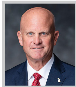
Mayor Kevin Cole*

Elections in the City of Pearland Election Day: May 6 | Early Voting: April 24-May 2