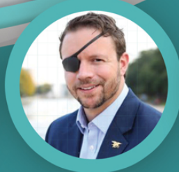
Dan Crenshaw U.S. Representative & Author of Fortitude