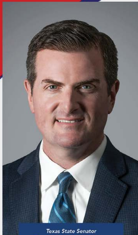
Texas State Senator Brandon Creighton