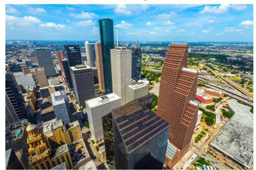
The complete July 2019 market report will be posted in the HAR Online Newsroom beginning this Wednesday, August 14.

Home buyers accounted for the greatest one-month volume of single-family home sales of all time in Houston. July single-family home sales totaled 8,953, up 11.6 versus one year earlier. On a year-to-date basis, sales are running ahead of 2018's record volume by 3.0 percent.