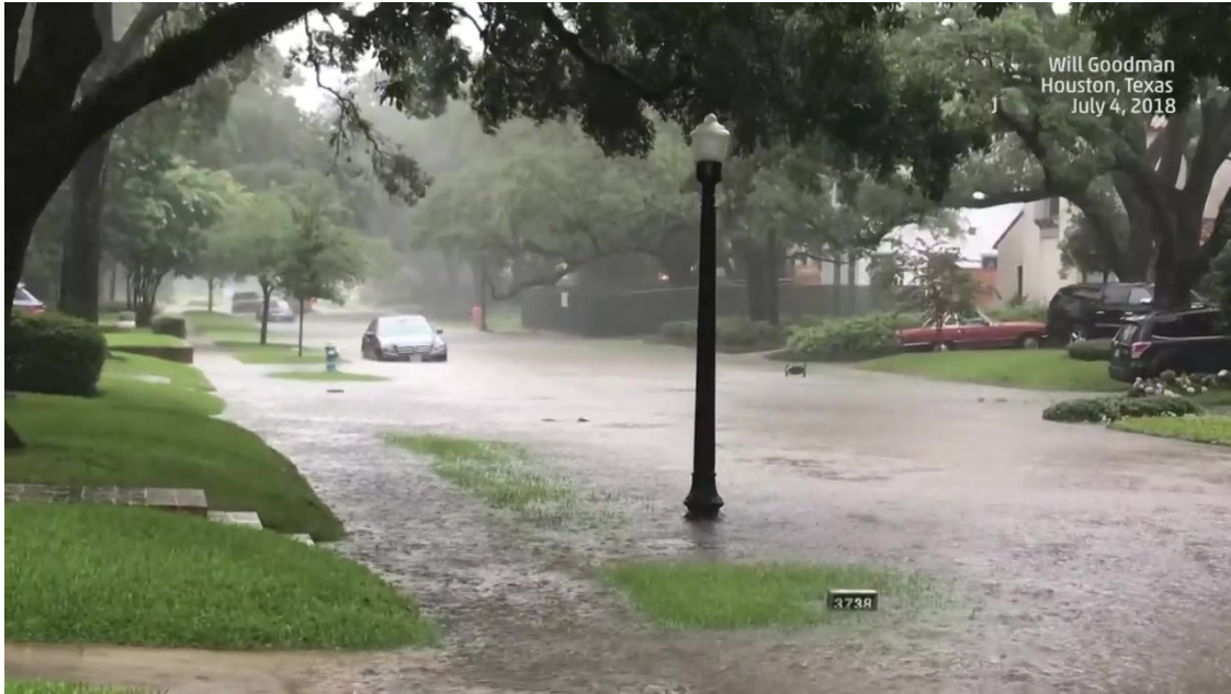
Will Goodman Houston, Texas July 4, 2018

HAR's participation rate in this Call For Action stands at 7.91%. We can do much better!